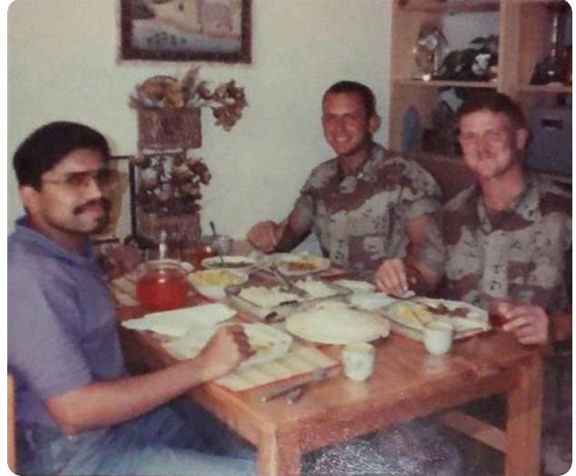
Easter Brunch 1991 March.